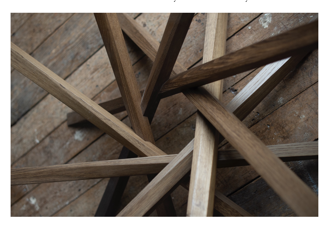
Nest in fumed oak

Nest (coffee table) and Eyrie (dining table) encourage an aerial perspective of the architectural, nest-like oculus created by the interlocking leg design. The legs twist both individually and collectively as they spiral from the floor up to the glass tabletop, inspired by the self-supporting reciprocal structures found in Mandala style roofs. Modern day architecture still practices this construction technique, but iterations of the Mandala roof were first seen in Chinese architecture as early as the 12th century.